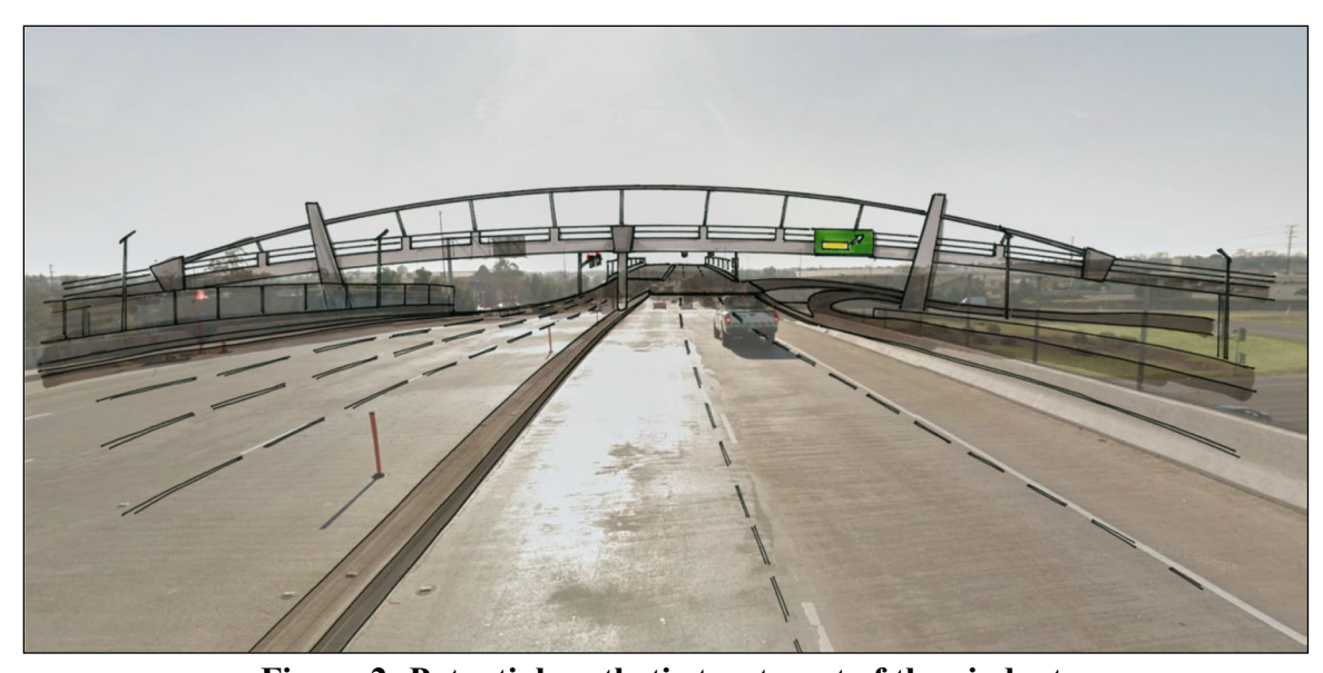
Figure 2: Potential aesthetic treatment of the viaduct

Due to the prominence of the Aerojet flyover viaduct, special aesthetics have been considered. The viaduct crosses over Hazel Avenue and would provide a gateway entrance to the proposed developments. One aesthetic concept is shown on the following page using an open railing, decorative arch structure and prominent column treatment. Aesthetic features for the bridges will be coordinated with the County, Caltrans, and Easton Place and adjacent Glenborough at East developers in future phases of the design. No other special aesthetic features are proposed except for interchange landscaping.