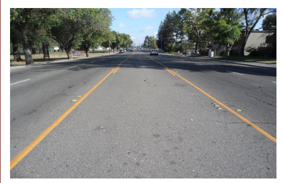
Existing Condition: Four lane roadway with a two way left turn lane and no bike lanes.