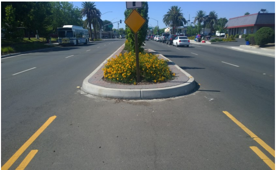
Similar Future/Proposed Condition: Four lane roadway with bike lanes and landscaped median.